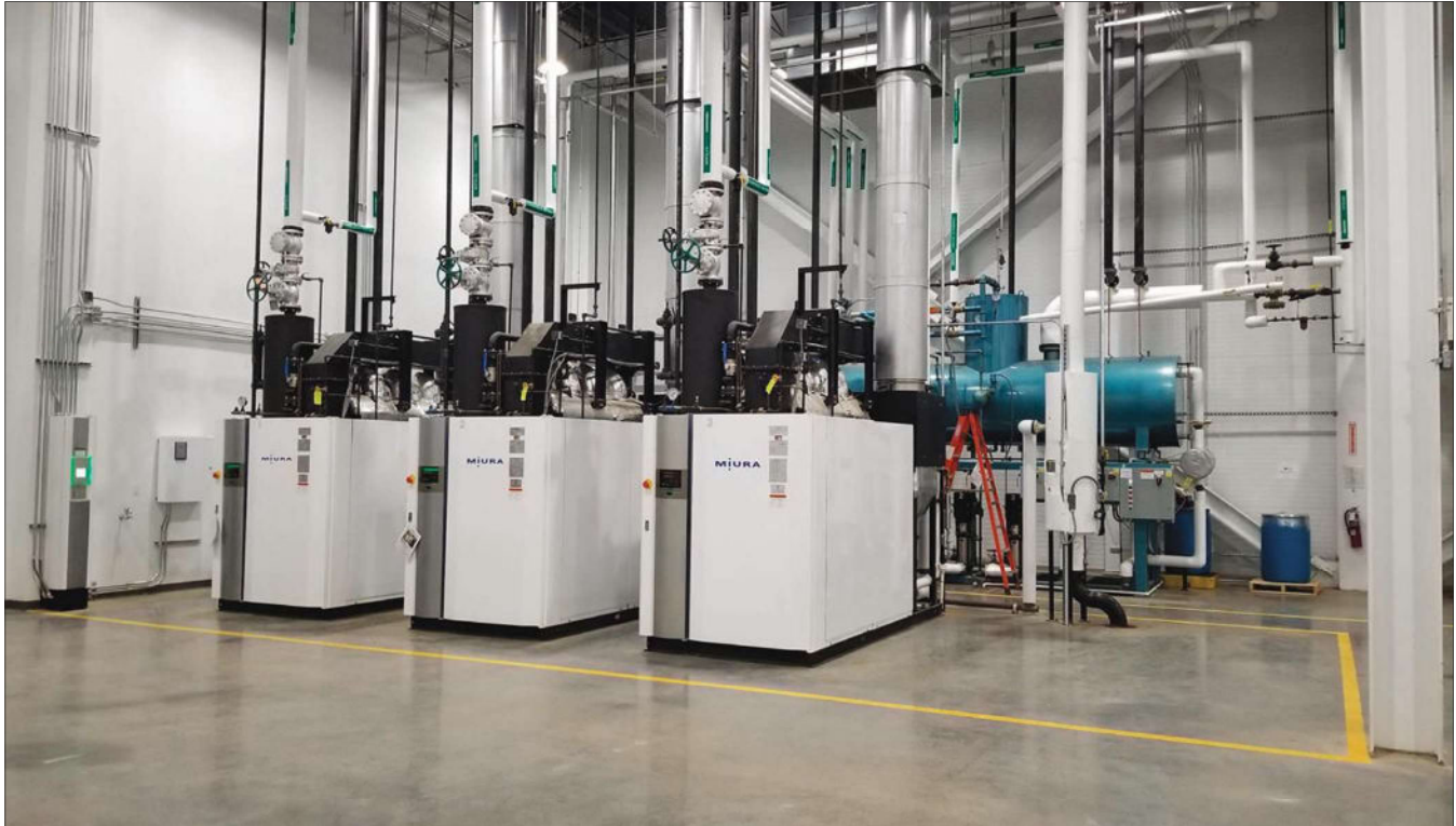
FIGURE 1. Miura's modular, once-through, watertube design boasts the ability to rapidly generate full steam, even from a cold start (on-demand steam).

fuel. Traditional boilers are typically placed in a standby or idle mode when not in use, which adds hours of run time, increases fuel costs, and requires personnel attention.