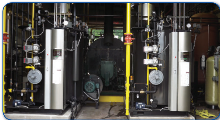
New installation of Miura EX-200 SGO dual-fuel on-demand boilers.

Miura's On-Demand Steam, Fuel Economy, High Performance, and Compact Footprint All Cited as Contributing to Major Efficiency Upgrade