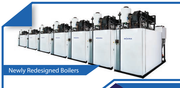
Newly Redesigned Boilers

We are constantly looking for innovative ways to increase our market share in this industry. Help promote our company by sharing with your network & Miura will pay you a commission! Contact us today for more information on how you can become an affiliate with Miura.