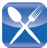
Food & Bev